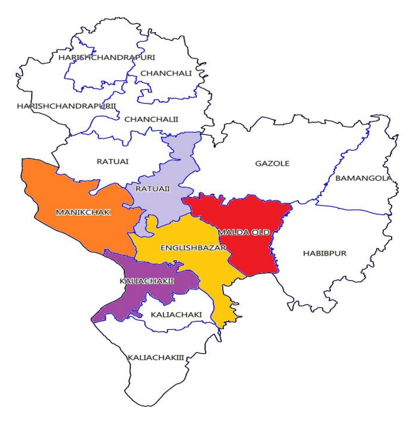
Fig. 1. Graphical view of the selectedblocks of Malda district

(PPSWOR) and at the second stage 168 farmers were selected randomly using simple random without replacement (SRSWOR) sampling sampling scheme (Mukhopadhvav, 2022). Out of total 15 blocks in Malda district, 5 blocks viz. English Bazar, Ratua-2, Manikchak, Kaliachak-2, and Old Malda are selected on the basis of area data under mango cultivation for the year 2022 (Figs. 1 and 2). Thereafter, 168 farmers are selected from the 5 blocks through SRSWOR. From these selected168 farmers, 110 farmers are sorted, leaving aside the farmers (58 nos), who have leased out their orchards. An interview schedule was prepared for door-to-door survey to note down the responses from the farmers (Annexure 1) during the month of February to March, 2023 with the cooperation from Assistant Director of Agriculture (ADA), Department of Agriculture, Government of West Bengal, of the respective block. Most of the mango varieties are being characterised by alternate bearing habit; the growers have to face an on year and off year pattern in the production that truly impacts the whole mango-based economy. That is why any research on mango cultivation/economy needs to take care of at least two consecutive years data. As such this study is based on primary data of 2021 and 2022, two consecutive on and off vear.