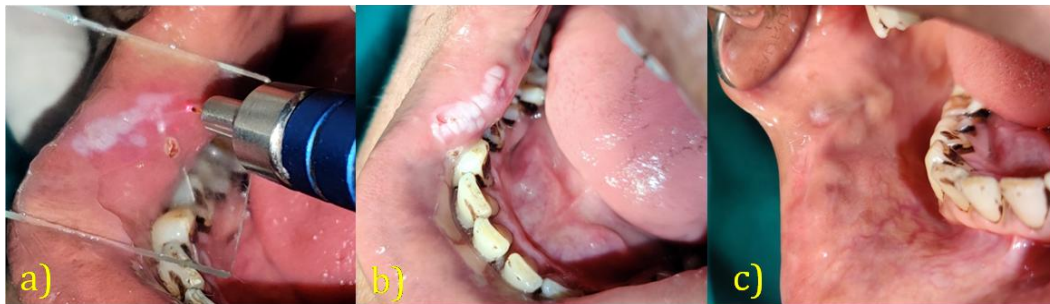
Fig. 2. a) TTP was performed by keeping the laser tip at 2mm distance from the lesion with glass slide, to prevent accidental perforation b) Procedure was completed with whitening of the entire lesion c) Complete disappearance of the lesion was seen after 20 days of laser treatment

periphery and then proceeds to the center of the lesion till the point of blanching. The lesion turns dark blue soon after injection (Fig. 1c). Postoperatively, antibiotics and analgesics were prescribed. The patient experienced severe pain (VAS score 8) without any other complications. The patient was recalled two weeks later and there was a 20% reduction in area (Fig. 1d). This injection was repeated with 0.2ml STS (Fig. 1e). The patient was reassessed every 10 days (Figs. 1e-1i). A small ulcerative lesion was noticed 10 days after the second injection, which eventually healed (Figs. 1f, 1g).