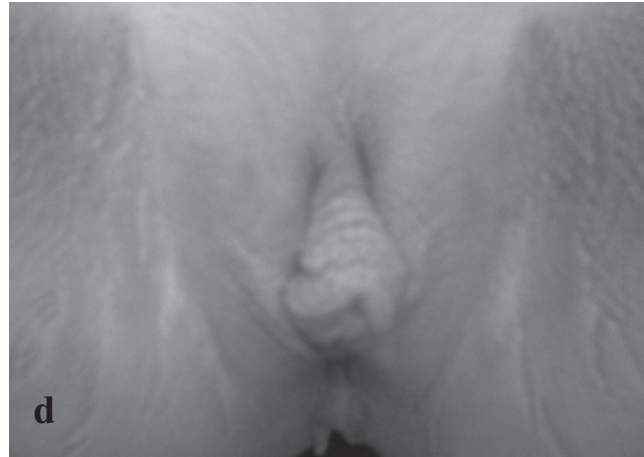
Fig 2. Clitoromegaly of the same patient